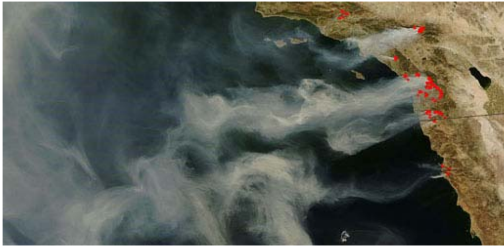
Figure 1 Discrete smoke plumes early in fire's evolution