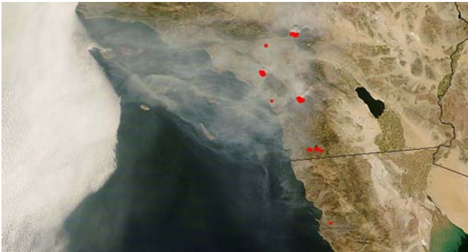
Figure 2 Less dense but more widespread smoke after days of air movement

Terrain affects weather, as well as fire and smoke behavior, in several ways. For example, as the sun warms mountain slopes, air is heated and moves upslope, bringing smoke and fire with it. After sunlight passes from a slope, the terrain cools and the air begins to descend. This creates a down-slope airflow that can alter the smoke dispersal pattern seen during the day.