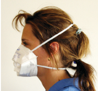
N95 respirators can help protect your lungs from wildfire smoke. Straps must go above and below the ears.