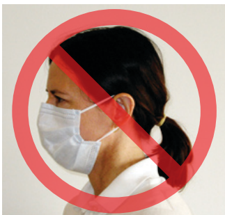
A surgical mask will NOT protect your lungs from wildfire smoke.

Wildfire smoke can irritate your eyes, nose, throat and lungs. It can make you cough and wheeze, and can make it hard to breathe. If you have asthma or another lung disease, or heart disease, inhaling wildfire smoke can be especially harmful.