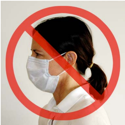
Figure 6 A surgical mask, which is designed to capture infectious particles generated by the wearer, is not a respirator and would provide little or no protection from smoke particles.