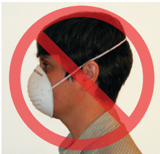
A one-strap paper mask will NOT protect your lungs from wildfire smoke.