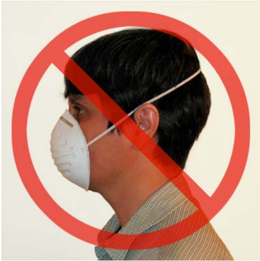
Figure 5 A one-strap paper mask is not a respirator and would provide little or no protection from smoke particles.

cannot provide the protection that respirators do. Commonly available one-strap paper dust masks, which are designed to keep larger particles out of the nose and mouth, typically offer little protection. The same is true for bandanas (wet or dry) and tissues held over the mouth and nose. Surgical masks are designed to filter air coming out of the wearer's mouth, and do not provide a good seal to prevent inhalation of small particles found in wildfire smoke. Incorrect use of respirators, or use of other, less protective face coverings, may give the wearer a false sense of security and encourage increased physical activity and time spent outdoors, resulting in increased exposures.