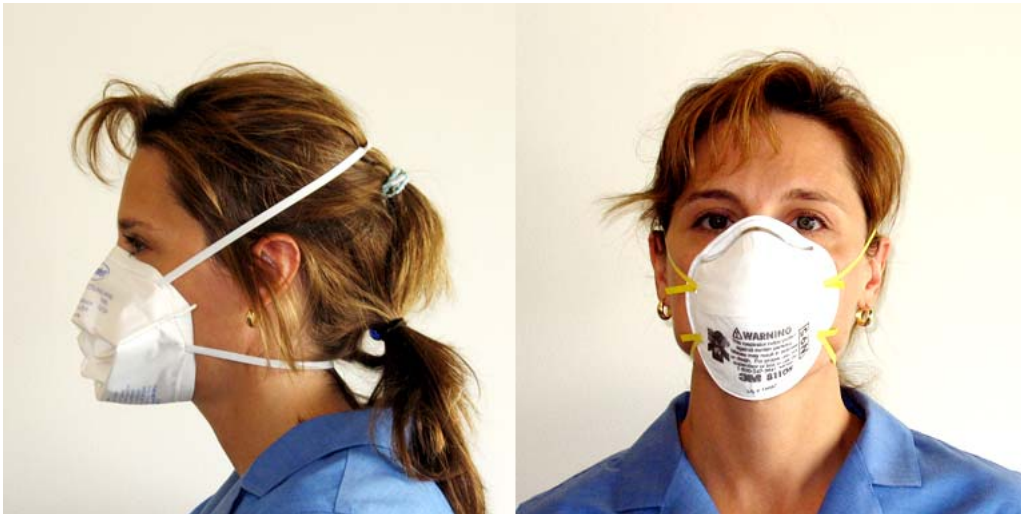
Figure 4 Two types of recommended N95 Disposable Particulate Respirators. Note the presence and placement of the two straps above and below the ears.

Filtering facepiece respirators are a type of respiratory protection in which the entire respirator is comprised of filter material. The most common types are called N95 (used in health care settings to protect against inhalation of infectious particles) and P100 (used to protect against toxic dusts such as lead or asbestos). Filter material rated “95” will capture at least 95% of very small particles, while material rated “100” filters out at least 99.97%. These respirators must be certified by the National Institute for Occupational Safety and Health (NIOSH), with the words “NIOSH” and the designation “N95” or “P100” appearing on the filter material. P100 respirators are more expensive than N95 respirators and will have somewhat higher resistance to airflow. The cost difference may make people reluctant to change them out when necessary, so N95 respirators may be preferable in wildfire smoke situations. Leakage around the respirator will result in more particles inhaled by someone wearing a respirator than passage through the filter material. Therefore, in practice, particularly without formal fit testing, N95s and P100s will provide similar levels of protection against wildfire smoke.