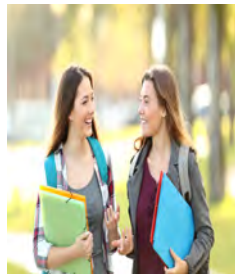
Banking for students