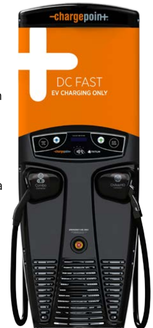
ChargePoint Express 200 50 kW DC Fast Charging Station

Note that not all plug-in cars on the road today have a DC fast charging port. Most plug-in hybrids can only charge at Level 1 or 2.