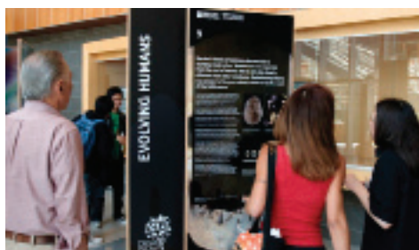
Visitors browsing the "Darwin Now" exhibition during its opening reception on May 6 at the La Kretz Hall lobby.