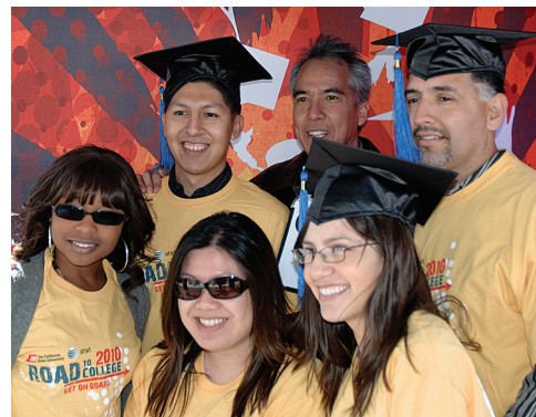
Cal State L.A. Outreach team take part in the CSU Road to College Bus Tour May 11 at Huntington Park College-Ready Academy.

As part of the California State University/AT&T Road to College Bus Tour, more than a dozen Cal State L.A. ambassadors from the University's Outreach and Recruitment office were at its College Corps partner school—Huntington Park College-Ready Academy—to help the high school students navigate their paths to college.