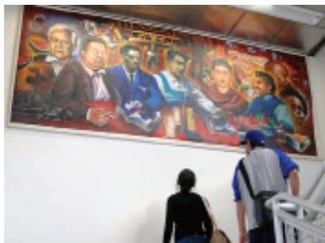
Many students heading to their classes in King Hall paused to survey and admire the "Homage to the Mexican Masters" mural.