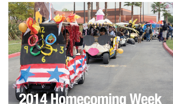
2014 Homecoming Week

For a video of the discussion: http://bit.ly/1hcJmDV .