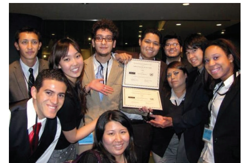
CSULA delegates at the National Model U.N. conference in New York.

With a 19-member delegation representing the Republic of Cuba, Cal State L.A. garnered top awards in all three categories at the recent annual National Model United Nations conference in New York.