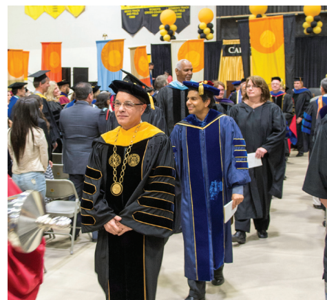
President Covino marched with the platform party during the processional for the University's Honors Convocation. More than 5,000 students were honored for their academic achievements and scholarships.