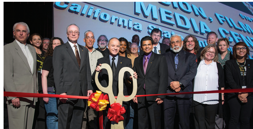
President Covino (c) was on hand for the ribbon-cutting ceremony to celebrate the opening of the new Television, Film & Media Center on campus.