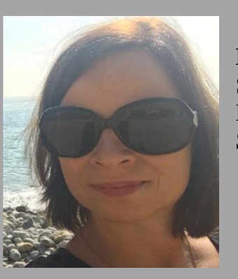
Symposium at Cal State LA in April 2022.

Cameroonian students as mediators between the German Democratic Republic and the Union des Populations du Cameroun, 1958-1967' at the "Comparing cultures of solidarity: socialist internationalism and solidarity across the Eastern Bloc and beyond" Workshop at the University of Cambridge, June 20-21, 2022.