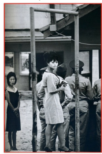
A Journal of Historical Inquiry

California State University, Los Angeles Department of History