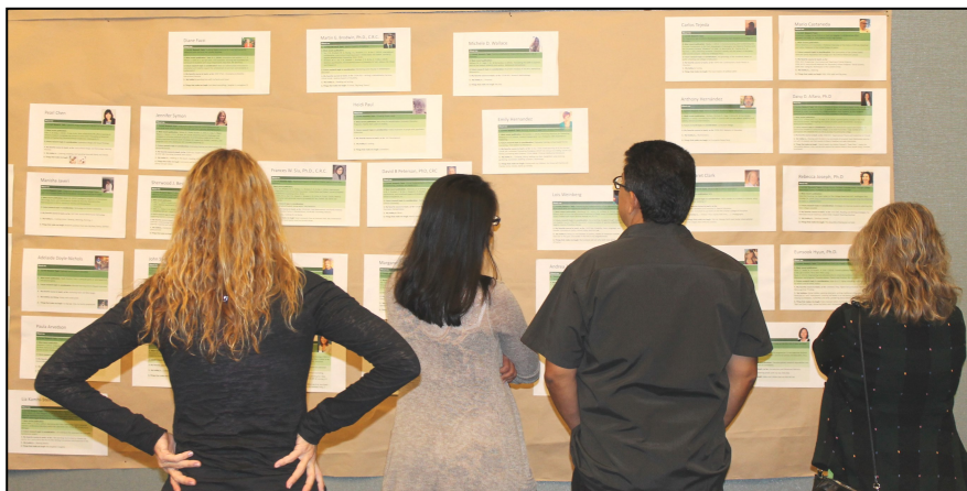
SAW Engagement Activity with the CCOE Faculty