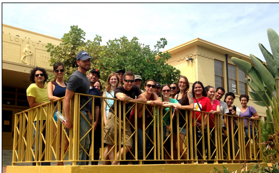
Los Angeles Urban Teacher Residency Program Students