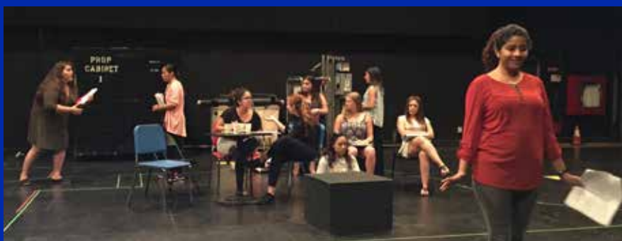
Latina Rehearsal 10/2016