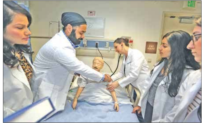
The Patricia A. Chin School of Nursing received the 2017 Health Professions Higher Education Excellence in Diversity (HEED) Award for the second consecutive year.

These must have style staples are available at Vidorra, located at 100 E. Main St. Follow their Instagram, Facebook, and Twitter pages @shopvidorra (#ShopVidorra).