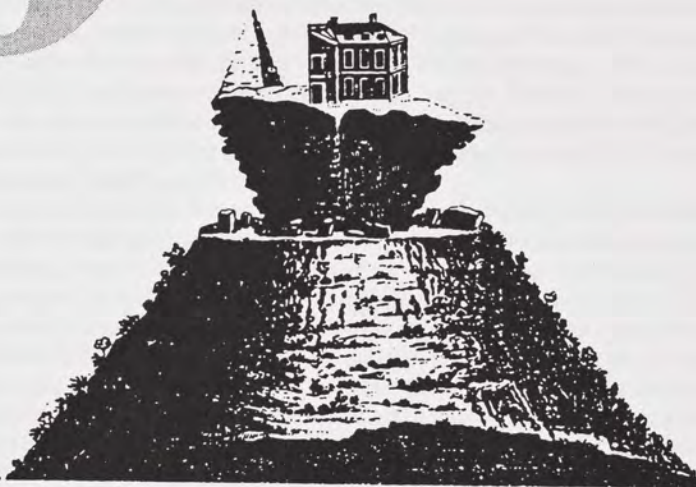
The Ramona campus proved daunting for faculty and students until rope ladders were installed.