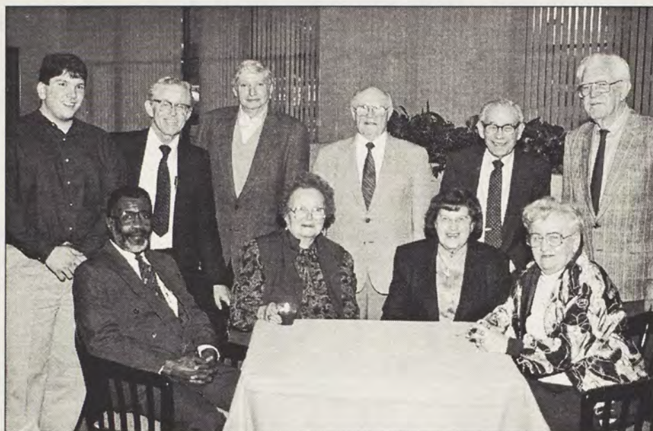
Emeriti faculty socialized with campus administrators, faculty, and students at the Emeriti Reception.