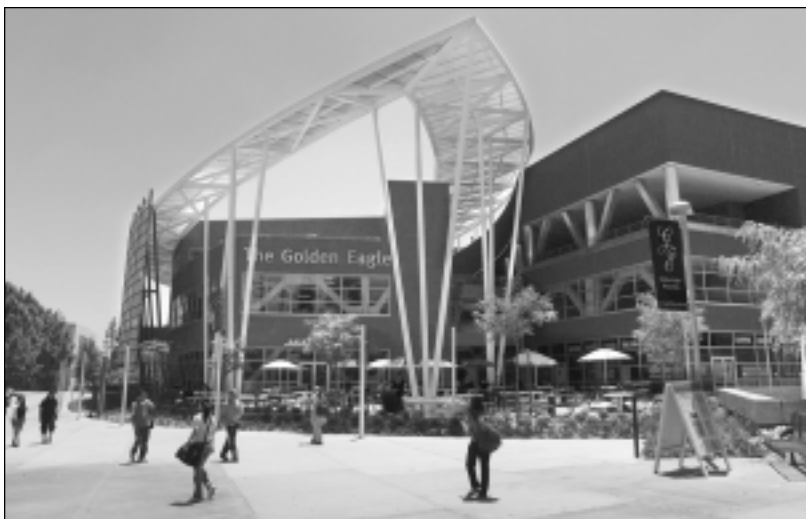
The Golden Eagle, newly completed, facing south from the main walkway.