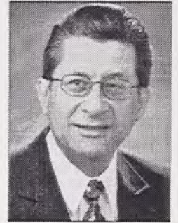
See FALL LUNCHEON, Page 3