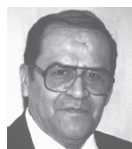
Jaime Escalante – Famed math educator