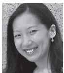
Leana S. Wen, M.D. 2007 Rhodes Scholar