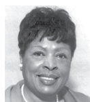
Diane Watson – U.S. Congress, 33rd District