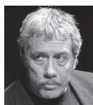
Edward James Olmos – Actor, filmmaker