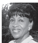
Maxine Waters – U.S. Congress, 35th District