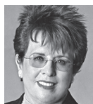
Billie Jean King – International all-time tennis great, winner of 20 Wimbledon titles

Alma mater of 210,000 alumni . . . contributing to the future of Los Angeles and the world, including: