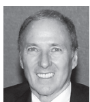
Joseph Wambaugh – Novelist and best-selling author