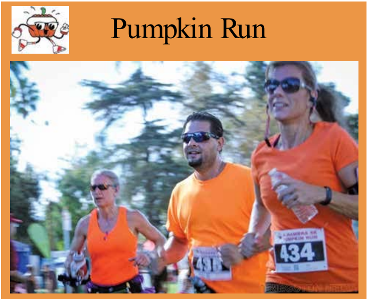
e City's third annual Pumpkin Run will take place Oct. 1 at Alhambra Park. In addition to the 5K and the kids' 1K, there will be a 10K for all.