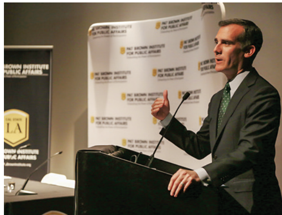
Mayor Eric Garcetti

In 1902, when DWP began as a water provider, the department faced similar issues to the ones we hear about in 2016: rising rates, underinvestment in infrastructure and lack of accountability. In terms of governance reform, we need to focus on the unchaining of bureaucracy at the DWP, especially with personnel and contracts. Unchaining of bureaucracy, however, does not mean that politics leave the DWP both because that’s impractical