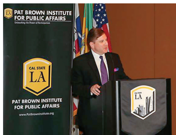
City Controller Ron Galperin

and because there still needs to be accountability. We need to strengthen the role of management by giving authorities the tools and power that they need to govern effectively. The most important thing going forward is to have an open process that includes the general public and the neighborhood councils. We also need to keep ratepayers informed and help them understand their bills in order for them to make good decisions on their own water and power usage. We can overcome the current obstacles and will see change at the DWP.