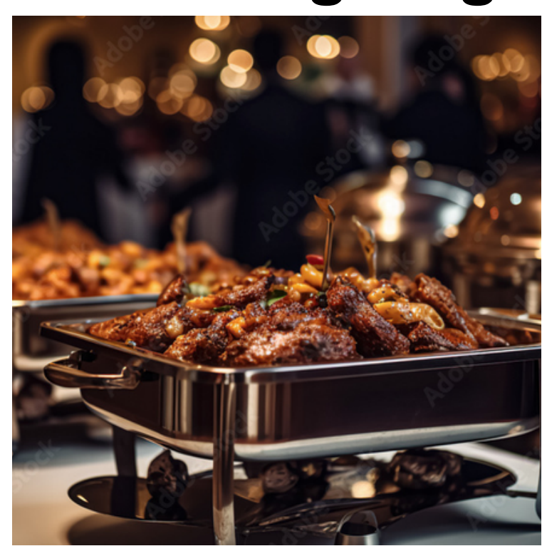
$300 per 3 spotlights Each Addt'l Set $150