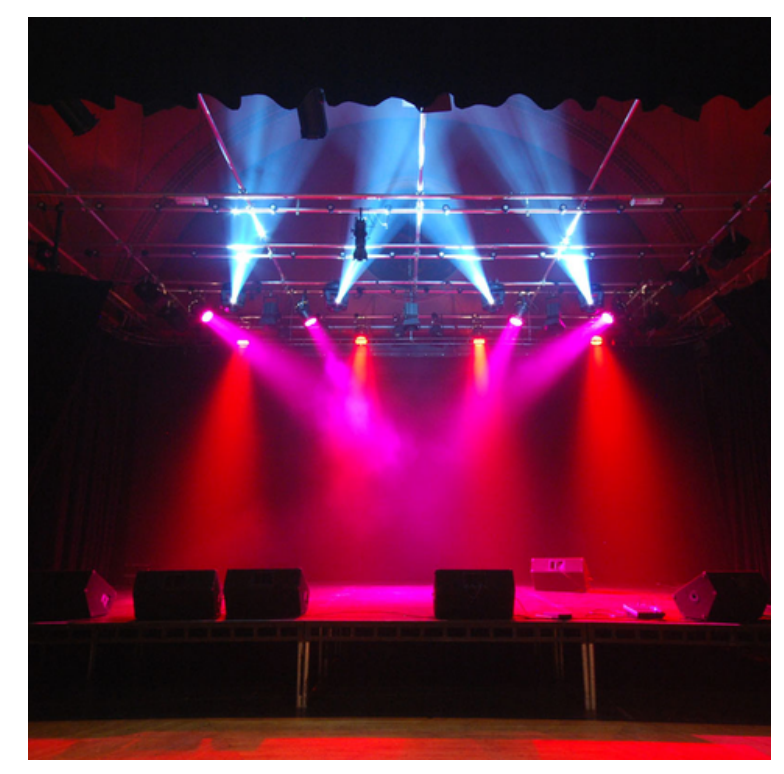
Small Stage - $500 Medium Stage - $750 Large Stage - $950