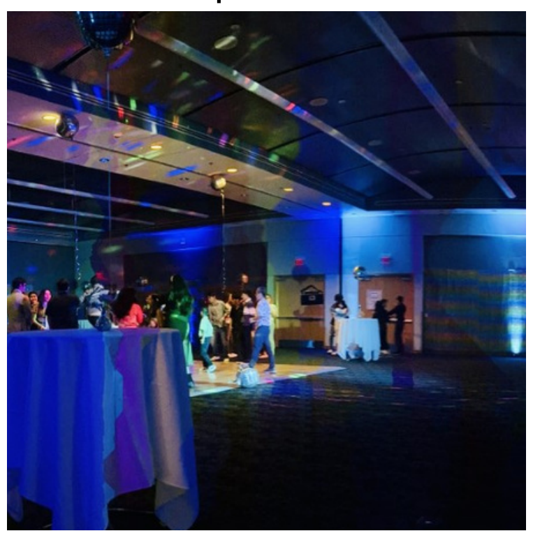
2 Ballrooms - $1,450 3 Ballrooms - $2,250