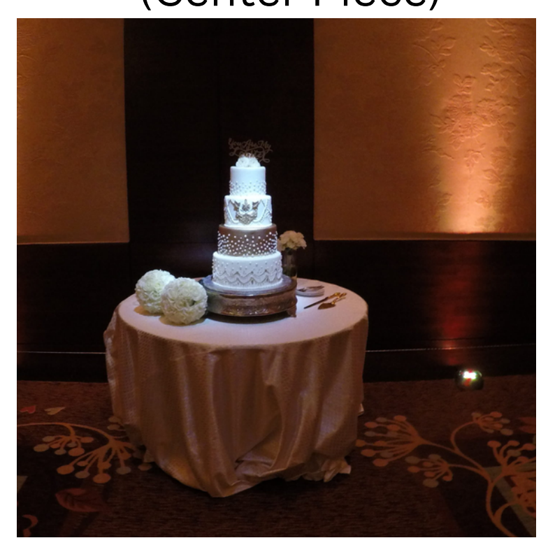
$75 per Table