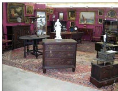
Chelsea Hill Antiques, Hampton, Conn.

Mr. Chippendale's Best was having fun over the weekend with sales of English paintings and Eighteenth Century furniture. The Snellville, Ga., dealer sold a game table to a young woman who had been looking at