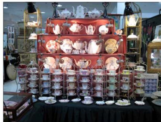
Victorian Rose Antiques, Wenham, Mass.

The Scott Antiques Market each month takes place the second weekend in Atlanta, Thursday through Sunday. For more information, 740-569-2800 or www.scottantiquemarket.com .