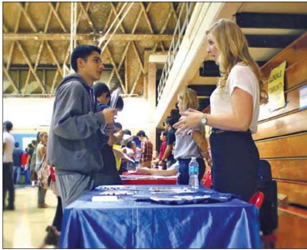
College, university, and military representatives from around the country convened at the 6th Annual AUSD College Fair at San Gabriel High School to reach out to students and their developing aspirations.