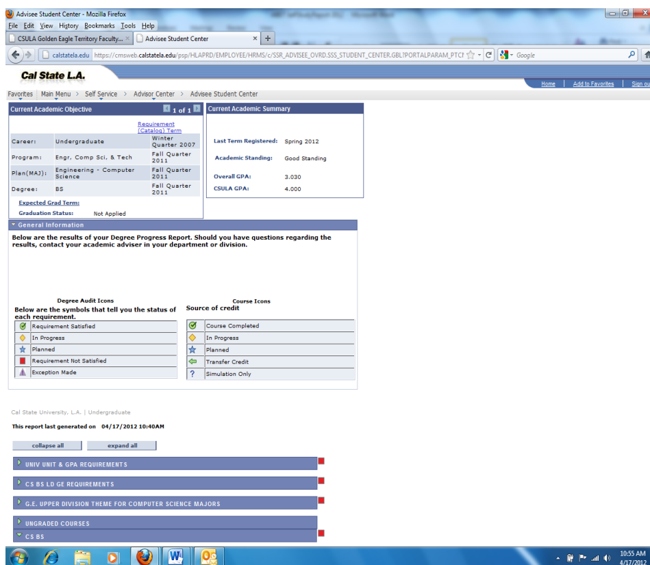
Figure 1.1: Academic Requirements Report on GET