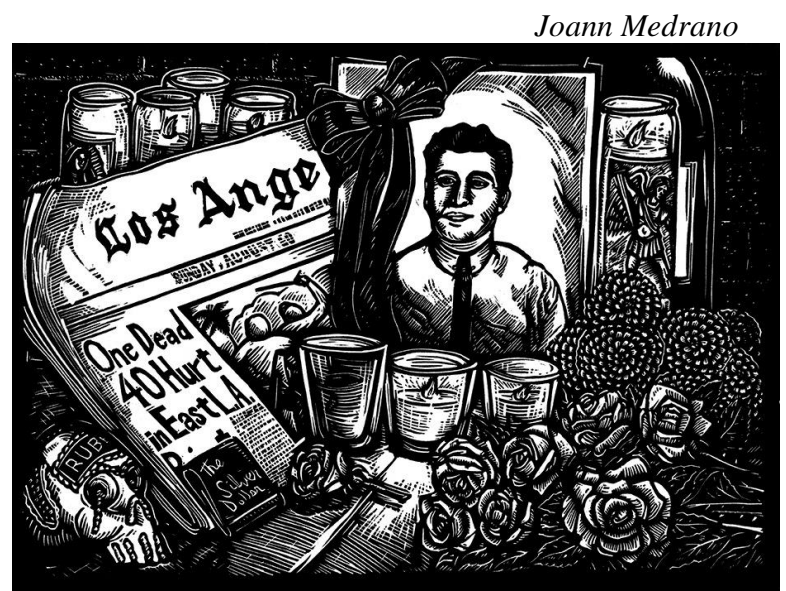
Figure 1. "Memorial for Ruben". Daniel Gonzalez, 2013 (Print).

The Ever-Changing Legacy of Ruben Salazar: A Reflection of Remembrance in East LA