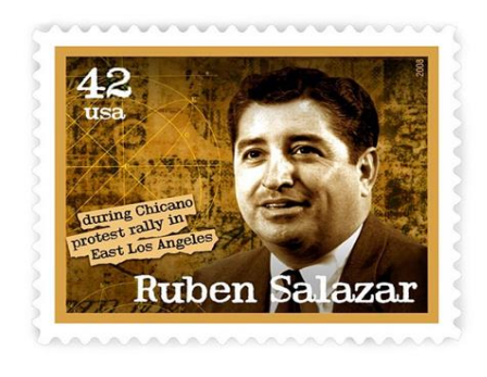
Figure 3. Salazar Stamp. United States Postal Service, 2008.

The Plaza De La Raza commissioned famed Mexican artist, David Alfaro Siqueiros, to create one of the most iconic images of Salazar, "Heroic Voice" in 1971. A striking piece, Siqueiros' illustration presents Salazar as a haunting figure, wearily gazing at the viewer. Below him, is another famous Siqueiros' figure, a shackled woman who represents the oppressed, originally from his mural "New Democracy."<sup>33</sup> The presence of the women, who was first painted in 1944, suggests that Siqueiros and other contemporaries of the 1970s, considered Salazar's death another example of injustice and social inequity. Its residence at the Plaza reflects the efforts of the Chicano community to tie Salazar to their community in the period immediately after his death.