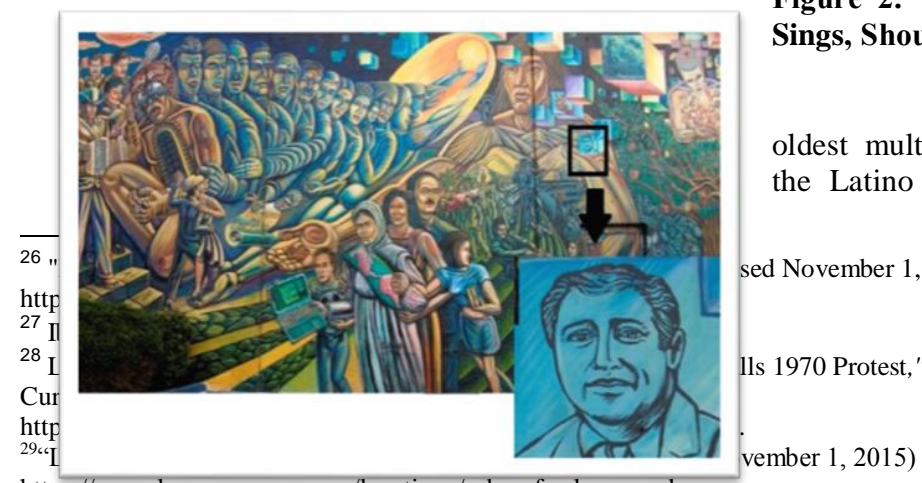
Figure 2. "The Wall That Speaks, Sings, Shouts." Paul Botello, 2000.

Similar to the dedication of Salazar Park, in October of 1982 The Ruben Salazar Bicentennial Buildings opened in the Lincoln Heights area of Los Angeles. The multipurpose structures were built as an add-on to the Plaza de la Raza, the