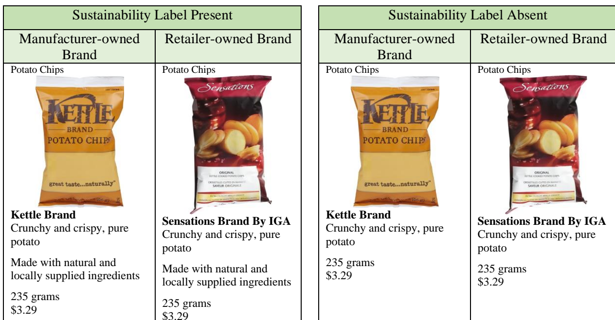
Figure 1 Experimental Stimuli

The experiment was specifically designed to examine whether a sustainability label improves or hurts a retailer store brand compared to a manufacturer brand and what is the role of brand familiarity on consumer evaluation. The focus of the test was on the presence (vs. absence) of a sustainability label (i.e., made from natural and locally grown ingredients) in the evaluation of potato chips—a product category with strong retailer store brand presence. We chose this sustainability label because it consists of two sustainability features: (1) environmentally friendly feature (made from natural ingredients), and (2) social feature (locally grown ingredients) (Belz 2009). Furthermore, the description included the average price of three leading potato chip brands as observed at multiple retailers at the time of data collection. See Figure 1 for more details.