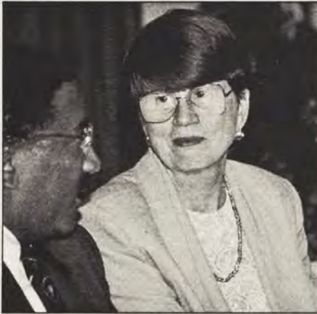
Inaugurating a cross-country, seven-stop series of community forum meetings, U.S. At-