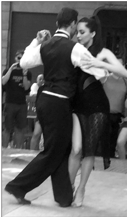
Tango in San Telmo.

We probably should have gone to the Glaciarium, the glacier museum/interpretive center, before visiting Perito Moreno itself. Instead, we took the museum shuttle for the three-mile drive back from El Calafate. The excellent dis-