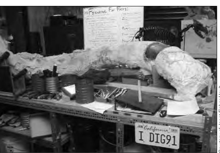
Still wrapped up, one of Zed's tusks has been cut, revealing a patch of dentin. The tusk requires protection, as it is extremely fragile.