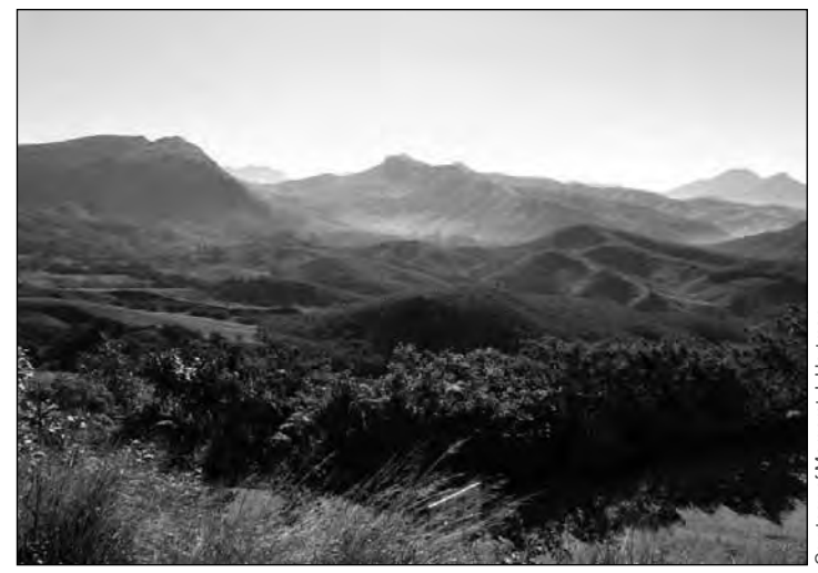
The Western Ghats from Eravilulam National Park.

After a week in the Ghats, we reached the lowlands again. We spent two full days in the moist See BIRDING IN THE WESTERN GHATS, Page 5