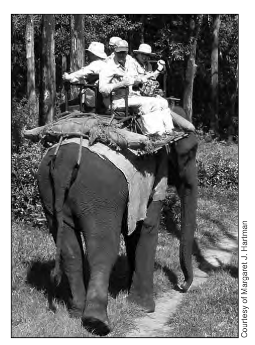
Birding on elephant back.

Before the British control of India, much of the Western Ghats was uninhabited; the natives found living in the lowlands much more salubrious. However, the British engaged in logging