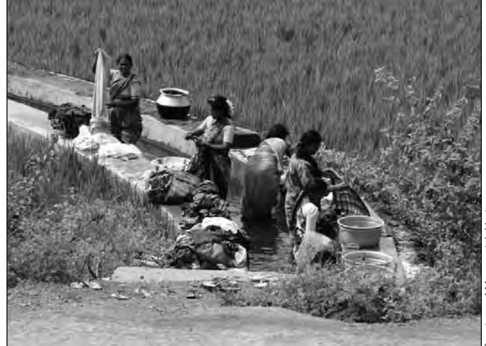
Laundry day in South India.