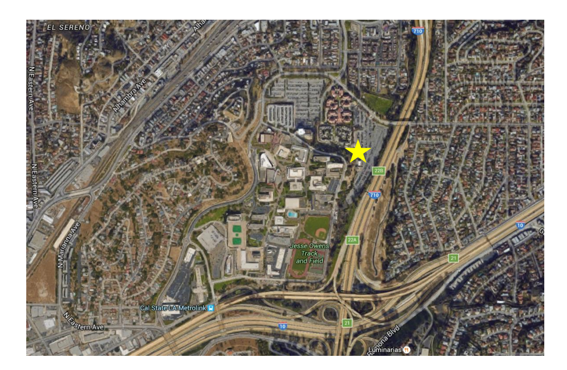
Figure 2 Location of the Cal State LA Emergency Operations Center