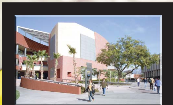
The Golden Eagle, opened in 2003, represents an evolving Cal State L.A. campus.