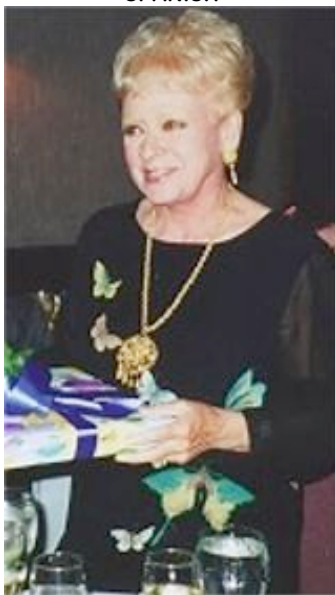
Sigma Delta Pi