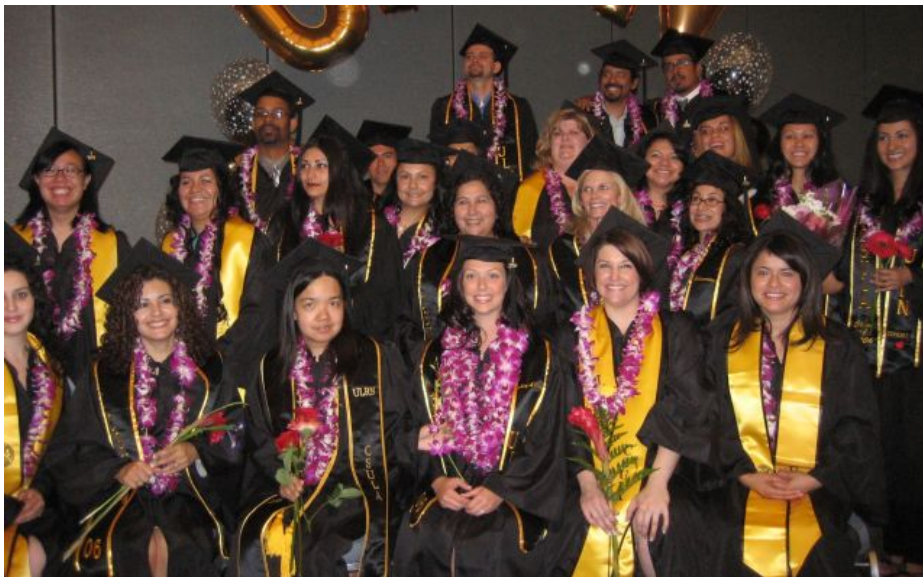
Urban Learning Cohorts J and K

Currently, there are three cohorts of students, about 27 students in each, going through the ULRN program and two new cohorts will begin this fall. The ULRN faculty, made up of members from the three divisions, AASE, EDSC, and C&I, look forward to celebrating the accomplishments of Cohort L who will graduate in June 2007!