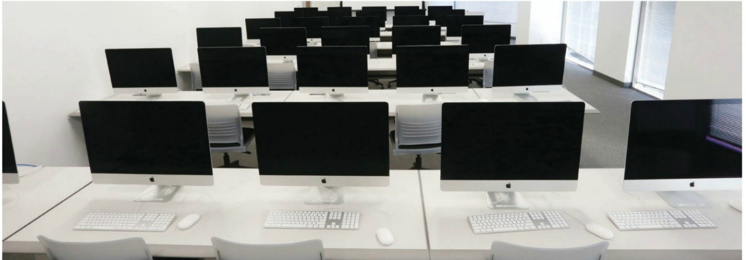
Cal State LA DTLA CAMPUS.22

Based at a 175-acre urban campus in the University Hills district of eastern Los Angeles, Cal State L.A. was ranked at #24 in Time magazine's top 100 colleges and universities in 2014, and last year at number 8 nationally in Washington Monthly's College Guide for top Master's Universities.