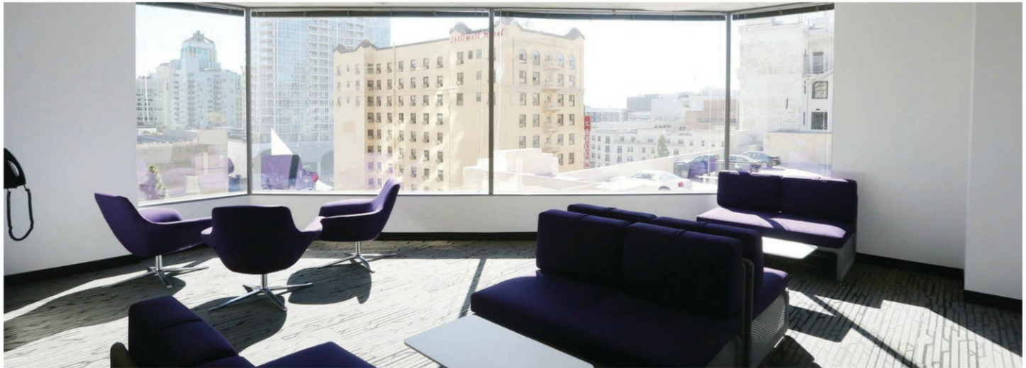
Cal State LA DTLA CAMPUS 18