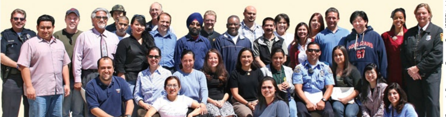
Community Emergency Response Team (CERT) training—class of April 2006.

Tip: Avoid long lines by picking up your permit early! We begin selling permits during the 10th week of the quarter and offer extended hours the first two weeks of the new quarter, including some Saturdays from 9:00 a.m. to 1:00 p.m.